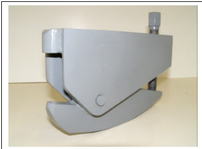
Door hinge pin press pictured above, steering wheel puller shown at right

To borrow either of these tools, contact Bob at 716-795-3569 or email Busnutbob@hughes.net Refundable deposit required; details upon request